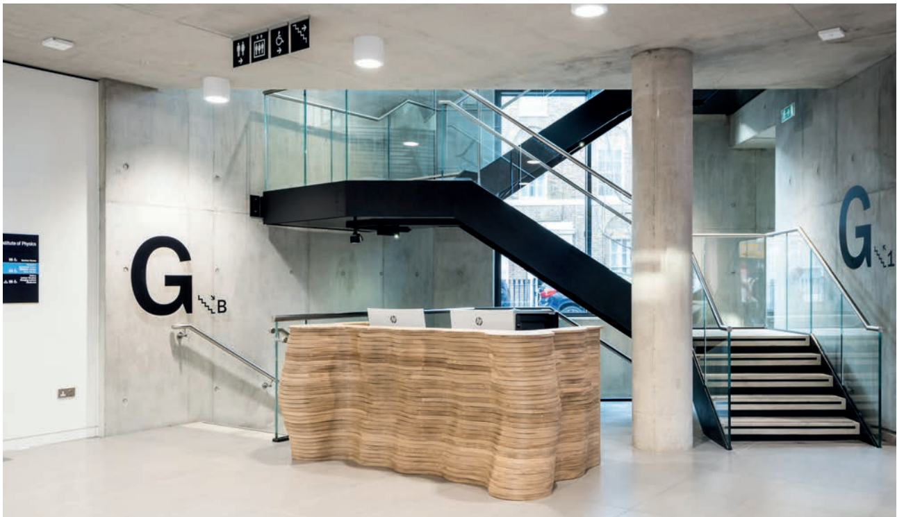
Reception desk and entrance