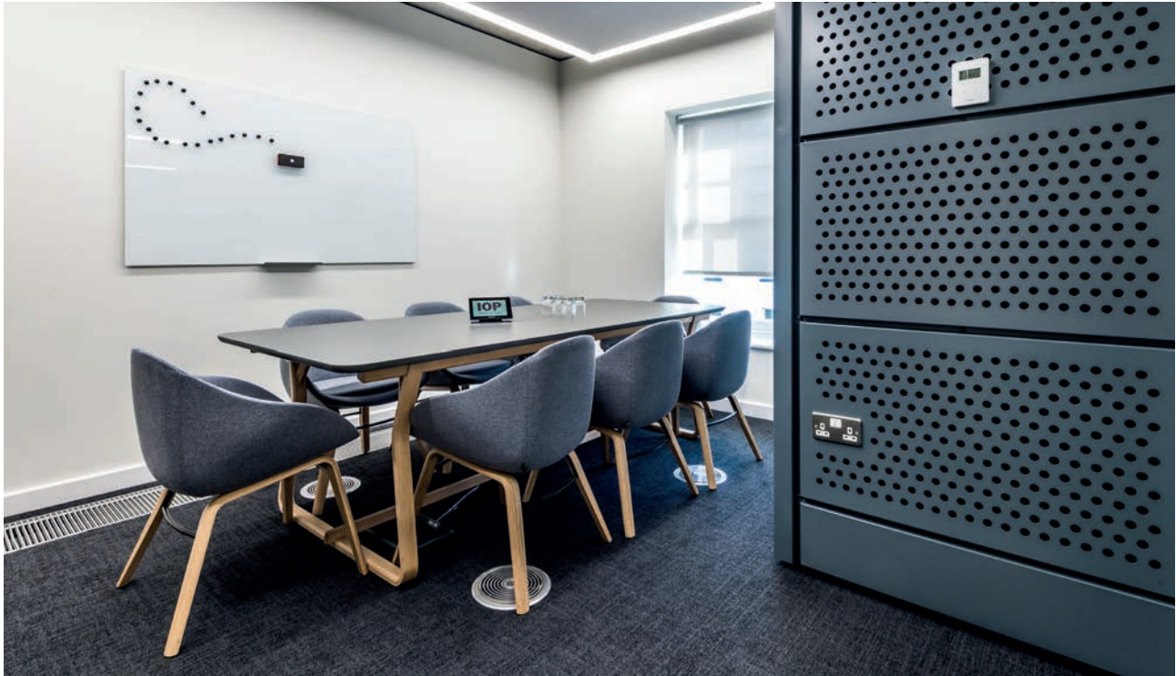
Example of a staff meeting room