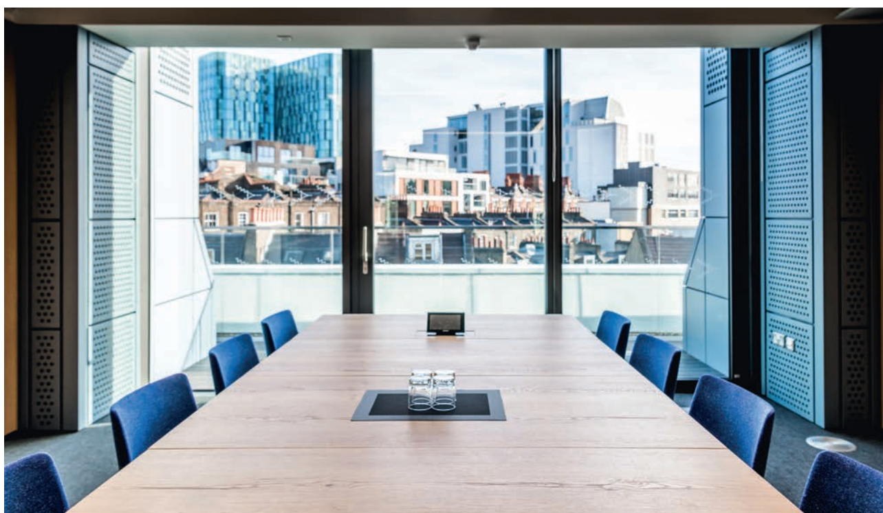
Example of third floor seminar room

The third floor contains four seminar rooms with balcony access on all sides and the council room. Members are able to book these rooms; please contact roombookings@iop.org for more information and to check availability.