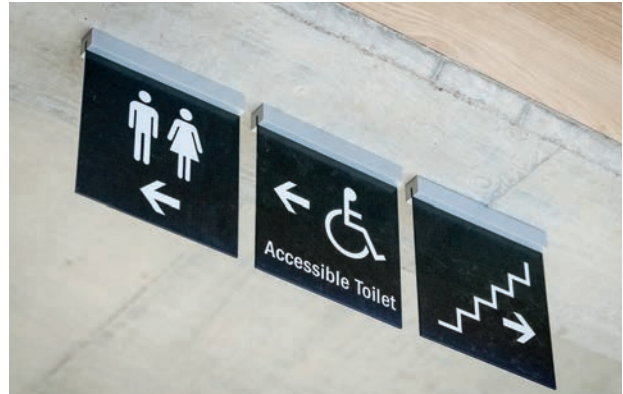
Accessible signage, black background with white writing

Lights are on an automatic sensor and may turn off after a period of inactivity or alternatively may turn on when entering a room due to movement.