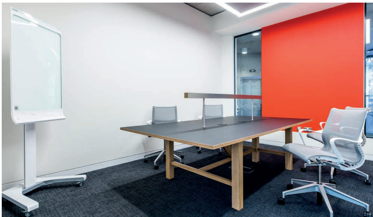
Example room in the Accelerator Space

We have pre-programmed mobile phones and supporting headphones available to use with the technology. Please contact your meeting organiser in advance to request one, or ask at reception on arrival.