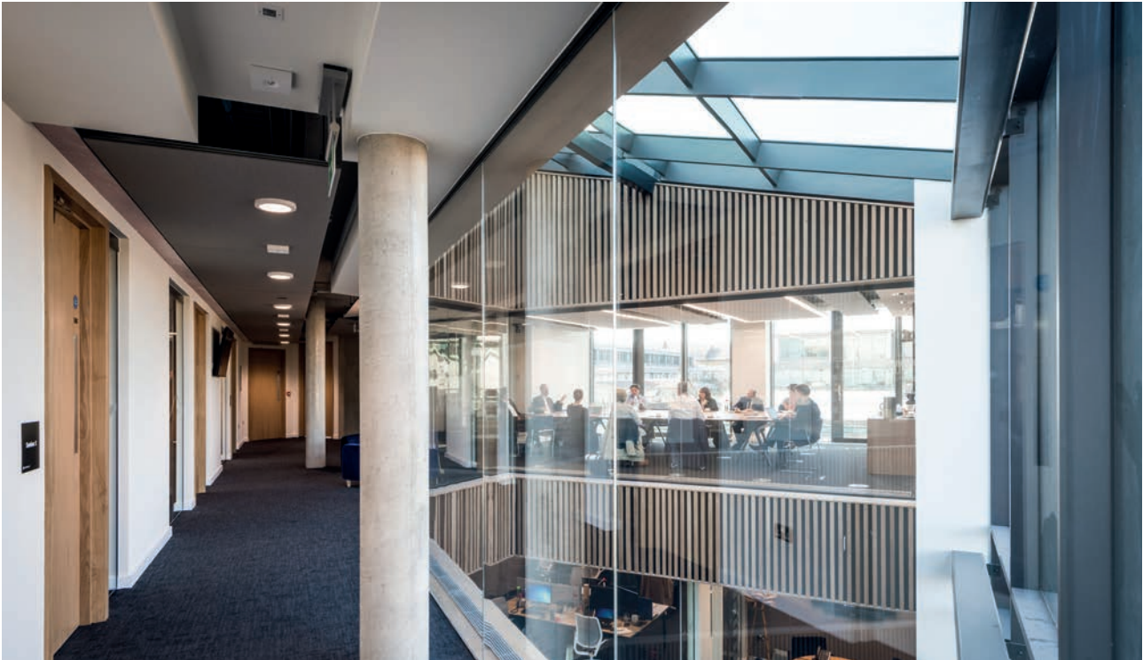
Third floor corridor width