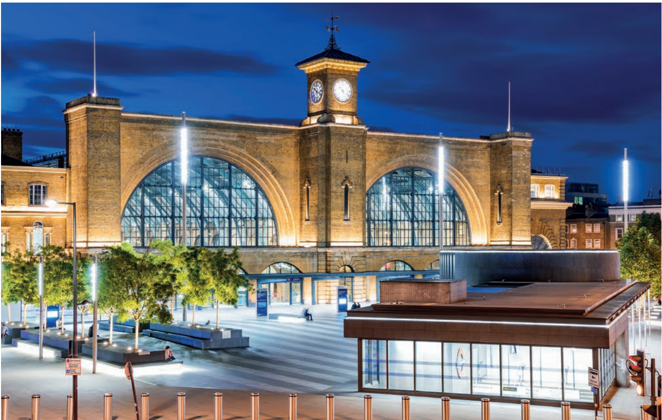
King's Cross Station