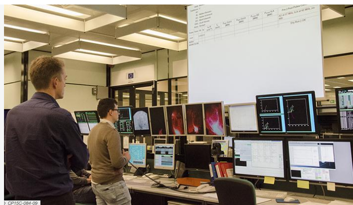
Photos: JET Control Room - November 2015.