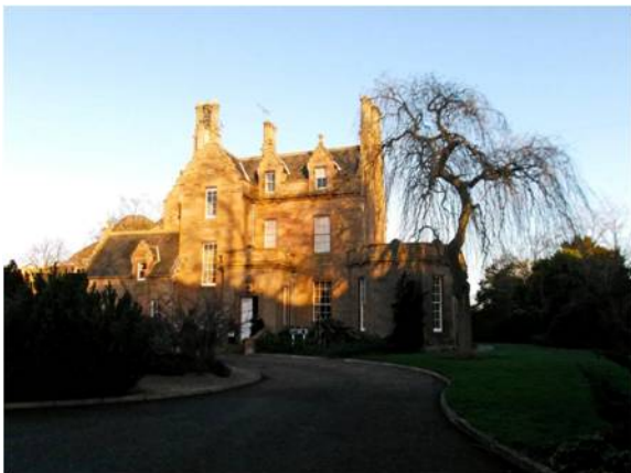
Abden House, Pollock Halls

The IoP Liquids and Complex Fluids group annual winter school for postgraduate research students was held in Edinburgh at the start of this year. The School was a welcome return to thinking about science straight after the Christmas and new year holiday period. Students got a feel for the luxuries of academic life, staying in the stunning Salisbury Green Hotel, an 18th century mansion on Pollock halls campus.