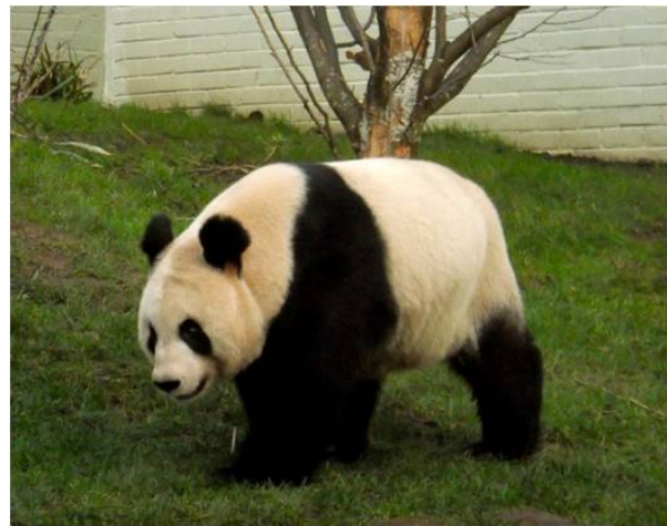
Tian Tian the giant panda at Edinburgh Zoo