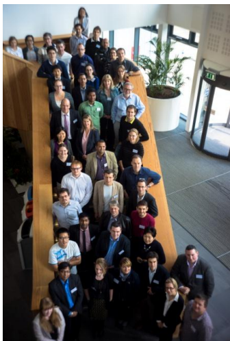
Left: Delegates of RAMS 2014 on the stairs of the Chancellor's Building, University of Bath

All in all, RAMS 2014 was informative, and a really great opportunity to get to know some fellow academics at an early career stage. If you are an early career academic in materials science, please consider coming along to RAMS 2015, which will be held at the University of Warwick in September 2015.