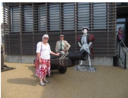
Conference delegates at the Mary Rose Museum

The afternoon session started with a talk by Alick Leslie from Historic Scotland entitled "Look but don't touch: Non-destructive testing and its application to the conservation of Scotland's built heritage". Historic Scotland has over 300 buildings and structures in its care, and changes to weather conditions, combined with budgetary constraints, are posing increasing difficulties in devising efficient and effective maintenance schemes. Emphasis is being given to monitoring and