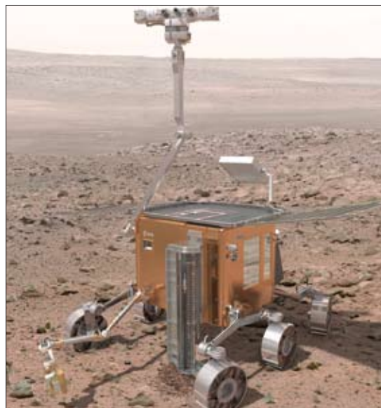
Top: the Beagle 2 lander leaving the Mars express orbiter. Courtesy: European Space Agency 2001. Illustration by Media Lab. Left: the ExoMars Rover – phase B1 concept. Courtesy: European Space Agency

as part of a portable system for diagnosing tuberculosis in Africa. Similarly, autonomous navigation systems being designed for future Mars expeditions (ExoMars to explore and sample the Martian surface and subsurface for past and current signs of life, and Mars Sample Return, which aims to bring Martian samples back to Earth) will find equally significant applications in terrestrial environments.