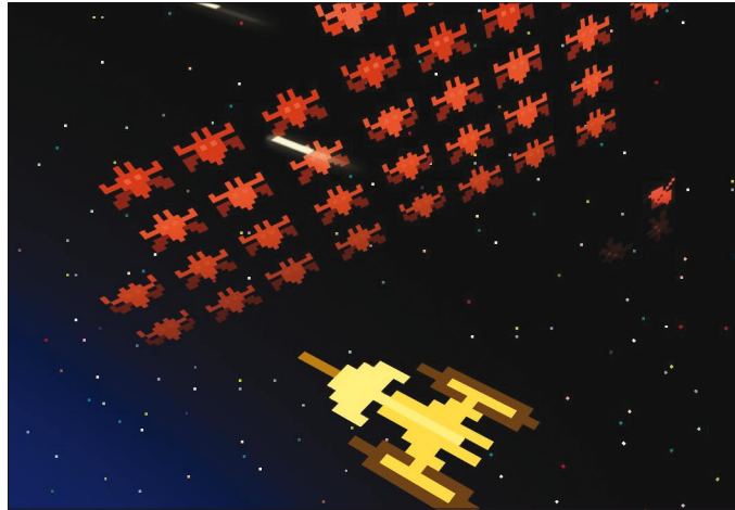
Computer games have come a long way since the arcade.