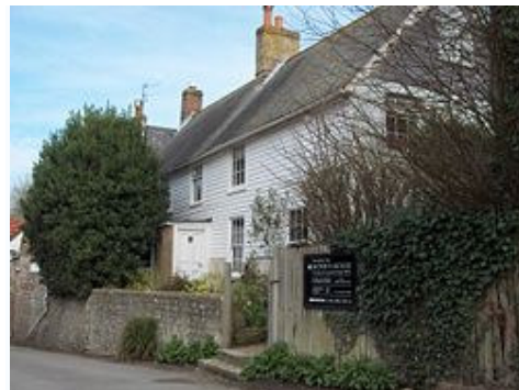
The front of Monk's house