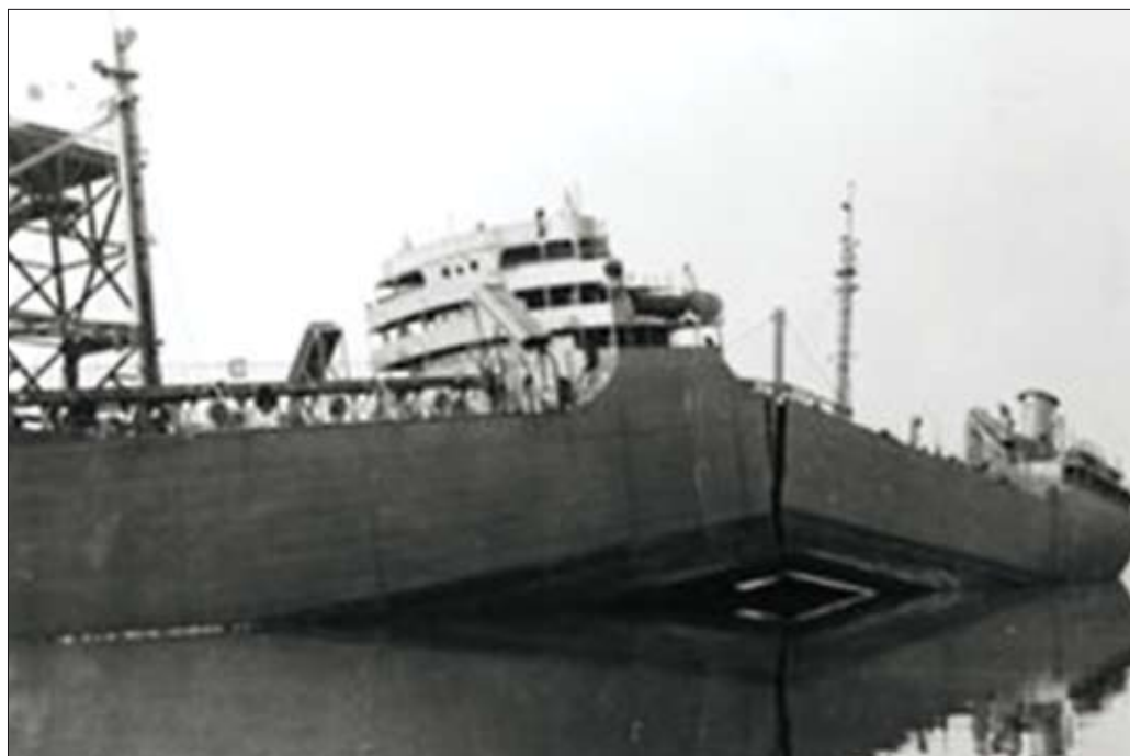
Liberty ships were the first all-welded, prefabricated cargo ships and were mass produced in the US. Some 2751 of these ships were built between 1941 and 1945. Only two now remain afloat; many were destroyed by cracking of the type shown above.

There were some intriguing overlaps. Teams from Kodak and DPS talked about inkjet printing – DPS's team covered high-speed printing on irregular