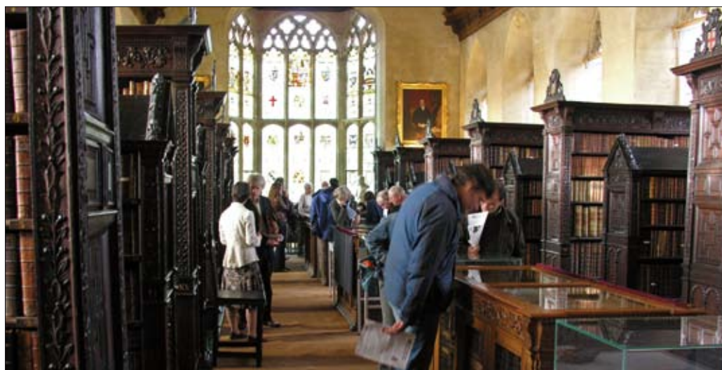
Visitors browse the Fred Hoyle artefacts that are archived at the Old Library in St John's College.